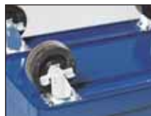
Reinforced Caster Channels