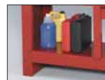
Large Bulk Storage