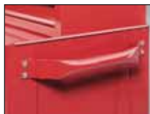
Cabinet Push Handle