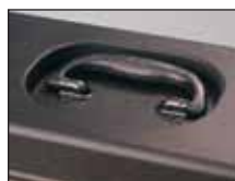
Comfort Grip Handle