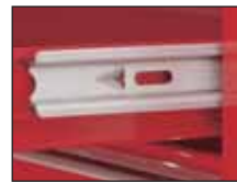
Smooth-Action Compound Slides