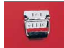
Over-Molded Chrome-Plated Handles