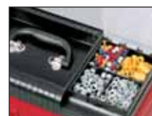
Topper Organizer (PCH2025 & HM2065 Models Only)

Products and specifications subject to change without notice.