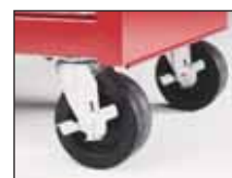
5 x 2 Inch Casters

Products and specifications subject to change without notice.