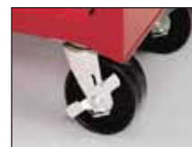
4 x 2 Inch Casters