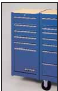
70156BK 70156 70156BU 6-Drawer Side Cabinet 15.9" W x 18.1" D x 35.3" H Capacity: 5,663 cu. in. Unit Weight: 86 lbs.