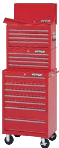
WI-624 6-Drawer Drop-Front Chest 26.1" W x 12.17" D x 15.44" H Capacity: 3,458 cu. in. Unit Weight: 63 lbs.