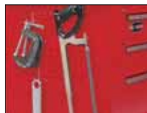
Steel Pegboard Sides