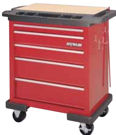
PC345 5-Drawer Deluxe Project Center 33.7" W x 19.7" D x 34.3" H Capacity: 8,334 cu. in. Unit Weight: 83 lbs.