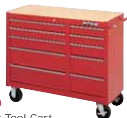
WI-1510 10-Drawer Tool Cart 40.95" W x 18.06" D x 34.65" H Capacity: 13,564 cu. in. Unit Weight: 172 lbs.