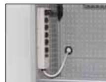
6-Outlet Power Strip