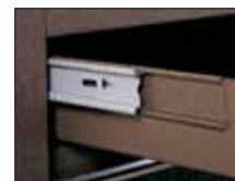
Smooth-Action Compound Slides