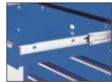
Quick-Release Ball-Bearing Slides