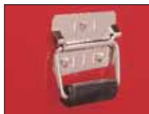
Over-Molded Chrome Plated Chest Handles