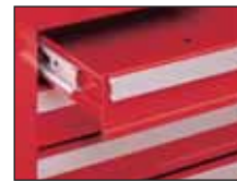
Full-Width Drawer Pulls