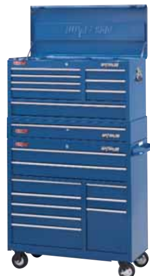
TRX4108BK TRX4108 TRX4108BU 8-Drawer Chest 40.5" W x 17.8" D x 19.8" H Capacity: 10,751 cu. in. Unit Weight: 133 lbs.