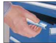
Posi-Latch™ Drawer System