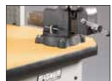
Sealed 1.5 Inch MDF Top on Workbench