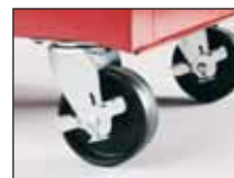
Solid 4.5 x 1.5 Inch Casters