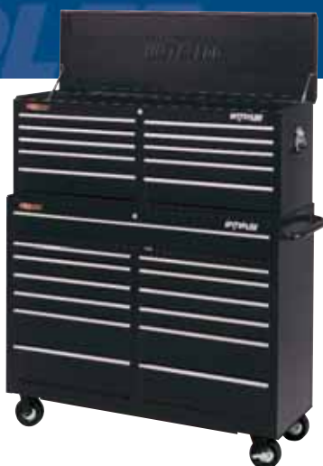
TRX5210BK TRX5210 TRX5210BU 10-Drawer Chest 51.1" W x 17.8" D x 19.8" H Capacity: 13,564 cu. in. Unit Weight: 174 lbs.