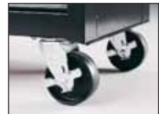
Solid 4.5 x 1.5 Inch Casters