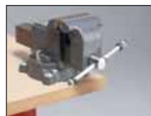
Extra-Thick MDF Wood Benchtop