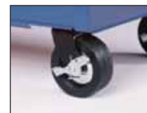
Solid 5 x 2-Inch Casters with Hubcaps