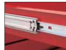
Heavy-Duty Ball-Bearing Slides