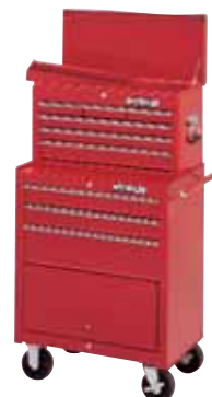
WI-600 6-Drawer Chest 26.1" W x 12.1" D x 15.4" H Capacity: 3,458 cu. in. Unit Weight: 45 lbs.