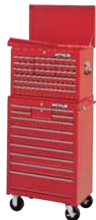
WI-1265 12-Drawer Chest 26.10" W x 15.97" D x 19.76" H Capacity: 5,845 cu. in. Unit Weight: 82 lbs.