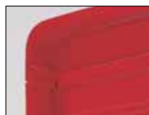
Watershed Design Over Full-Length Piano Hinge