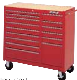
WI-1500 15-Drawer Tool Cart 41" W x 18.1" D x 41.1" H Capacity: 16,267 cu. in. Unit Weight: 231 lbs.