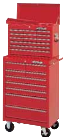
WI-1210 12-Drawer Chest 26.1" W x 12.08" D x 19.76" H Capacity: 4,327 cu. in. Unit Weight: 63 lbs.