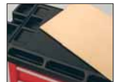
Versatile Molded Work Surface