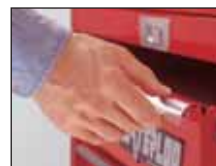
Posi-Latch™ Drawer Securing System