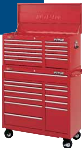
TRX4111BK TRX4111 TRX4111BU 11-Drawer Chest 40.5" W x 17.8" D x 19.8" H Capacity: 10,367 cu. in. Unit Weight: 143 lbs.