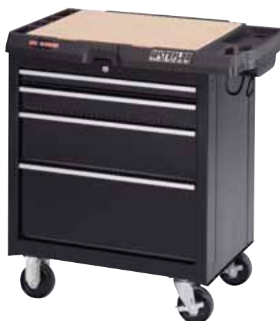
PMX2704PC 4-Drawer Deluxe Work Center 31.5" W x 21.8" D x 33.6" H Capacity: 6,165 cu. in. Unit Weight: 102 lbs.