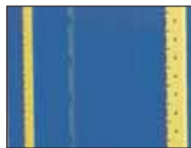
Sidewall Post Construction