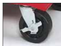
Heavy-Duty 5 x 2 Inch Casters