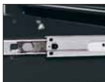
Ball-Bearing Slides (Not available on UC100)