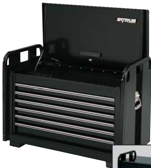
RB-3406 6-Drawer Road Box 33.1" W x 17.8" D x 20.6" H Capacity: 8,464 cu. in. Unit Weight: 179 lbs.