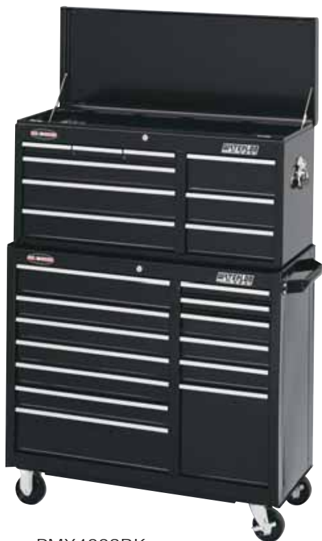
PMX4009BK PMX4009 PMX4009BU 9-Drawer Chest 40.5" W x 16" D x 19.8" H Capacity: 6,621 cu. in. Unit Weight: 121 lbs.