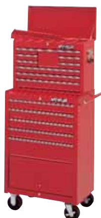
WI-1000 10-Drawer Chest 26.1" W x 12.1" D x 19.8" H Capacity: 4,350 cu. in. Unit Weight: 65 lbs.