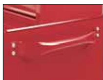
Tubular Side Handle