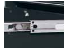
Full-Extension Ball-Bearing Slides