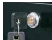
Lockable Keyed Drawers (Not available on UC100)