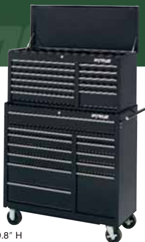
WI-1511BK WI-1511 WI-1511BU 11-Drawer Chest 40.5" W x 16" D x 19.8" H Capacity: 9,267 cu. in. Unit Weight: 110 lbs.