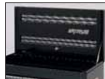
Reinforced Drop-Front Security Panel