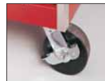
Heavy-Duty 6 x 2-Inch Casters