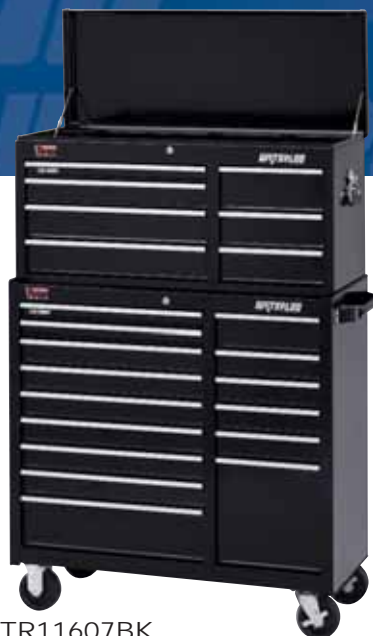
TR11607BK TR11607 TR11607BU 7-Drawer Tool Chest 40.5" W x 16" D x 19.75" H Capacity: 9,427 cu. in. Unit Weight: 128 lbs.