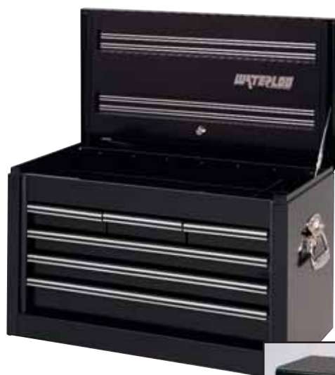
RB-2606 6-Drawer Worksite Chest 26.1" W x 13.85" D x 16.3" H Capacity: 3,781 cu. in. Unit Weight: 73 lbs.