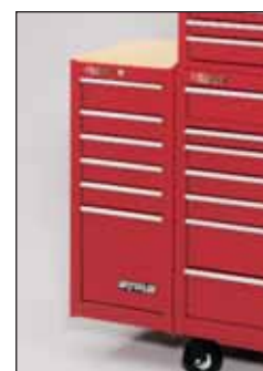
TRX1606BK TRX1606 TRX1606BU 6-Drawer Side Cabinet 15.9" W x 18.1" D x 35.3" H Capacity: 5,663 cu. in. Unit Weight: 91 lbs.