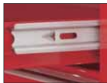
Smooth-Action Full-Extension Slides