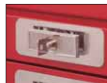
Pop-Out Twist-Turn Handle