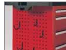
Steel Pegboard Sides