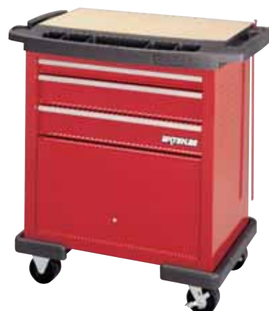
PC343 3-Drawer Deluxe Project Center 33.7" W x 19.7" D x 34.3" H Capacity: 9,368 cu. in. Unit Weight: 69 lbs.