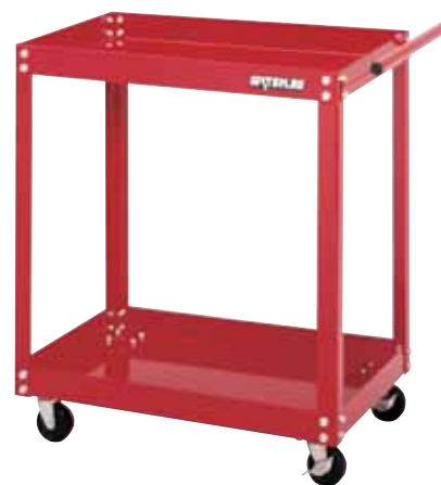
UC100 Basic Utility Cart 27" W x 18" D x 32" H Capacity: 13,608 cu. in. Unit Weight: 32 lbs.