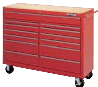
WI-5013R 13-Drawer Tool Cart 51.57" W x 18.06" D x 41.13" H Capacity: 17,430 cu. in. Unit Weight: 316 lbs.