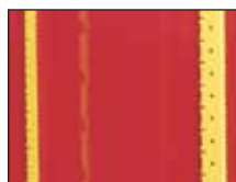
Sidewall Post Construction