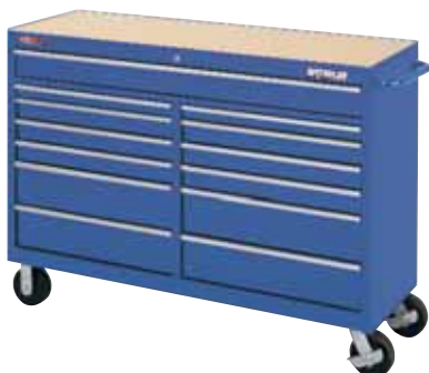
TRX6013BK TRX6013 TRX6013BU 13-Drawer Tool Cart 58.5" W x 20" D x 42.5" H Capacity: 24,026 cu. in. Unit Weight: 351 lbs.