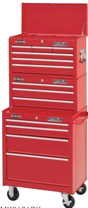
PMX2606BK PMX2606 PMX2606BU 6-Drawer Chest 26.1" W x 12.1" D x 15.4" H Capacity: 3,507 cu. in. Unit Weight: 45 lbs.