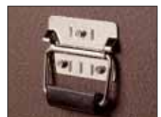
Over-Molded Chrome-Plated Handles