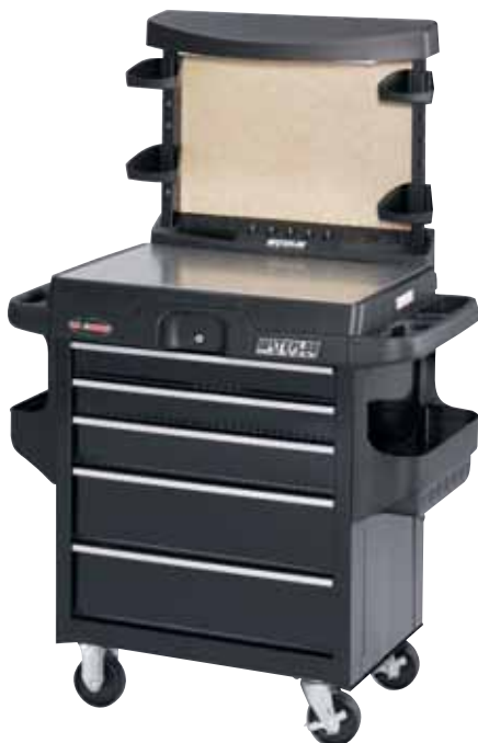
PMX2705PC-BW 5-Drawer Deluxe Work Center with Backwall 38.1" W x 23.4" D x 58.7" H Capacity: 9,276 cu. in. Unit Weight: 135 lbs.

All PMX Series Tool Storage Equipped with Ball-Bearing Slides