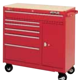
TRX4106BK TRX4106 TRX4106BU 6-Drawer Tool Cart 41" W x 18.1" D x 41.1" H Capacity: 17,001 cu. in. Unit Weight: 190 lbs.