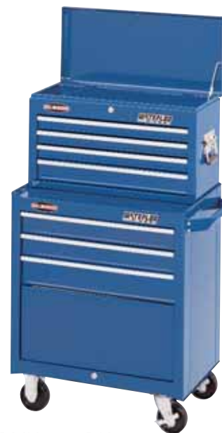
PMX2604BK PMX2604 PMX2604BU 4-Drawer Chest 26.1" W x 12.1" D x 15.4" H Capacity: 3,507 cu. in. Unit Weight: 45 lbs.