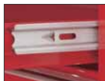
Smooth-Action Full-Extension Slides