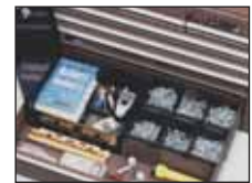
Handbook Divider and Organizer Tray