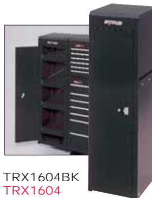
TRX1604BK TRX1604 TRX1604BU 4-Drawer Full-Height Locker 15.9" W x 18.1" D x 54.6" H Capacity: 12,133 cu. in. Unit Weight: 96 lbs.