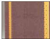
Sidewall Post Construction