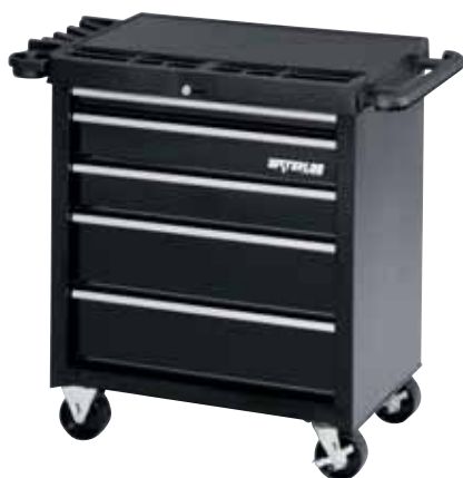
ML-510 5-Drawer Work Center 34.3" W x 19.2" D x 32.3" H Capacity: 8,269 cu. in. Unit Weight: 68 lbs.