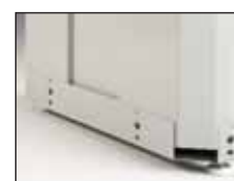
Adjustment Bracket For Workbench Height