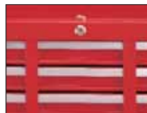
Keyed Lock Bar Security